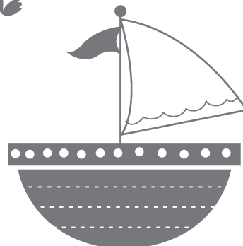
thinking of you