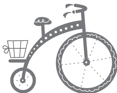
hello, dear friend